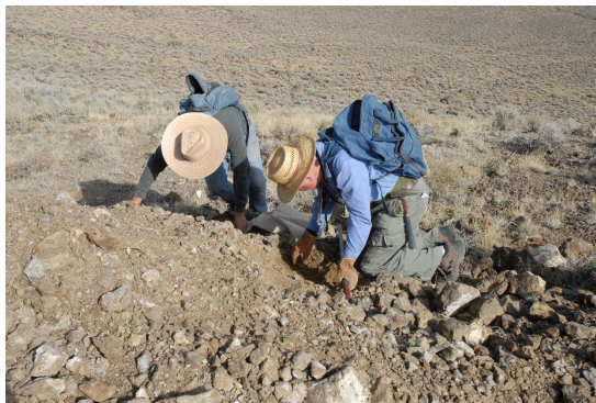
Searching in the NV desert