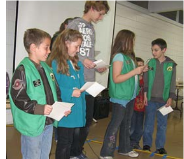
A Presentation by the Rookie Rock Rollers