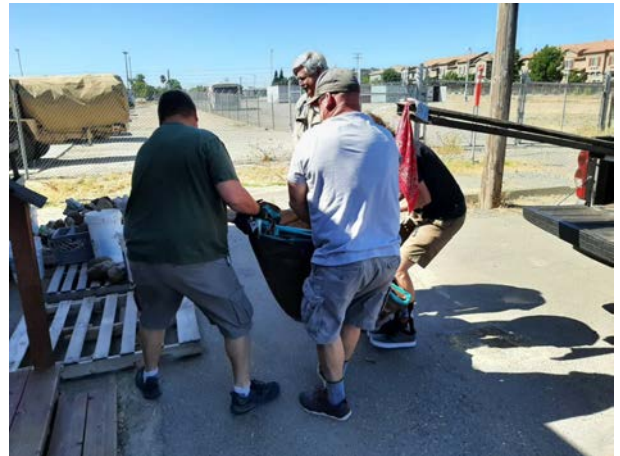
Off the truck and to the shop.