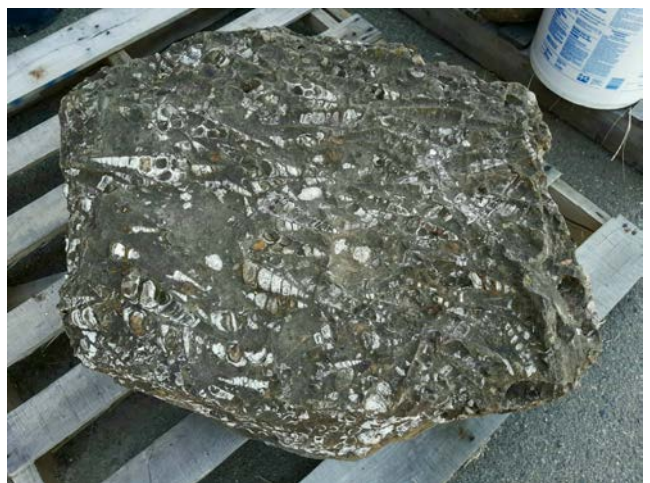
Close-up with a good view of the fossils.

The turritella rock specimen will hopefully be donated by the club to Sierra College.