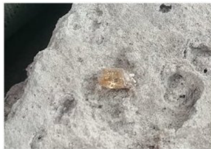
Topaz was found on the 2019 RRR trip to Topaz Mt. !!