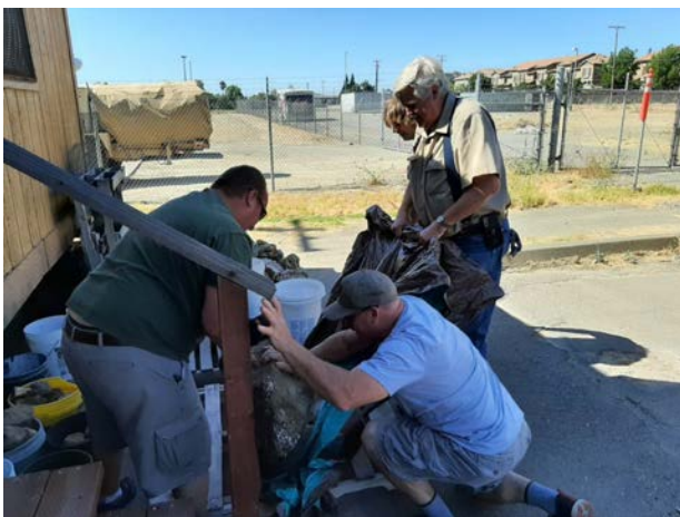
Onto a pallet near the shop steps.