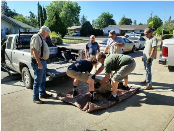
Loading it on the truck bed.