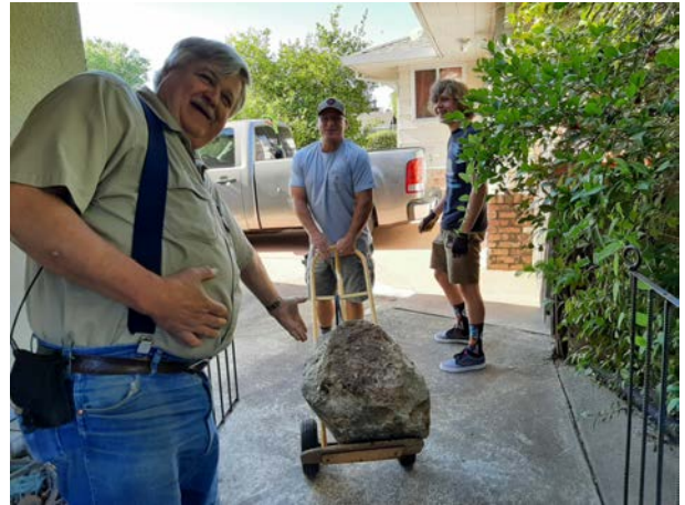
How big is that thing, anyway?.